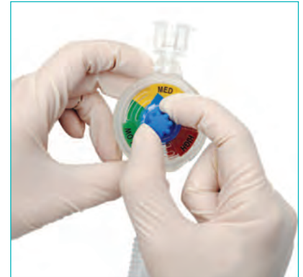
Neo-Tee® Standard adjustable, easy-to-read PIP controller and safety pressure relief