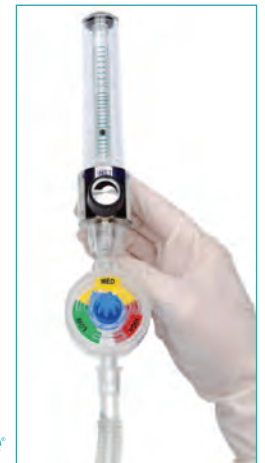
Neo-Tee® Infant T-Piece Resuscitator Adjustable PIP Controller with built-in pressure relief (Shown on Flowmeter)