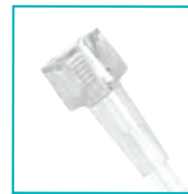
Universal Round O 2 D.I.S.S. Connector on in-line Neo-Tee