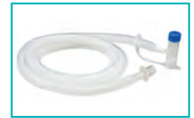
New! T-Piece Circuits Only, without manometer Now includes Cap & Strap